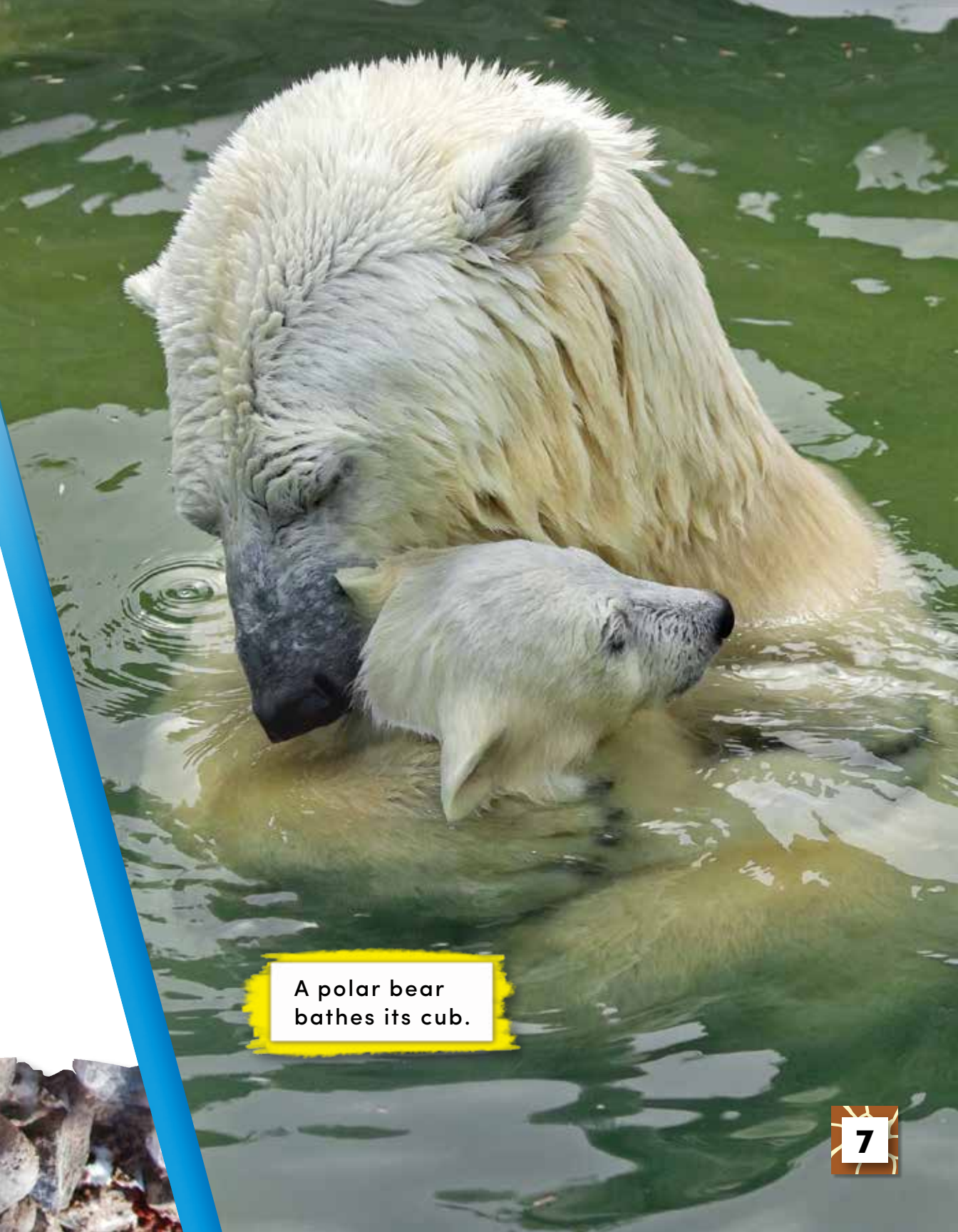
A polar bear bathes its cub.