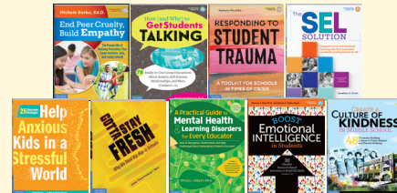
Mental Health Educator Resources, Middle and High School 9-Book Set 9798330914579