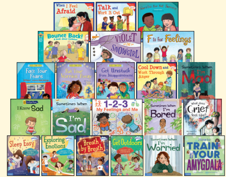
Mental Health Kindergarten, First/Second Grade 22-Book Set 9798330905768