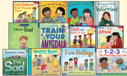
Mental Health Preschool and PreK 12-Book Set 9798330905782