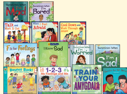
Mental Health Preschool and PreK 13-Book Set 9798330905775