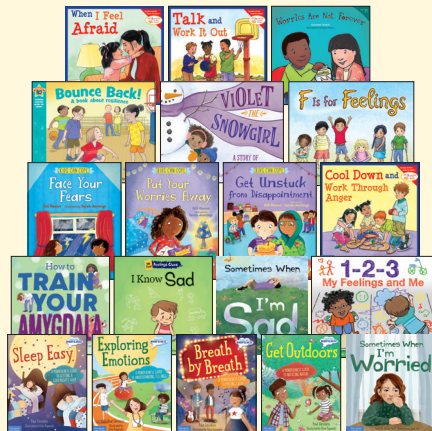
Mental Health Kindergarten, First/Second Grade 19-Book Set 9798330905799