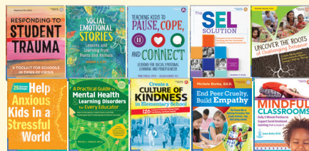
Mental Health Educator Resources Elementary 10-Book Set 9798330914562